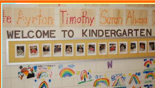
Hallway at Blairsville Elementary School.