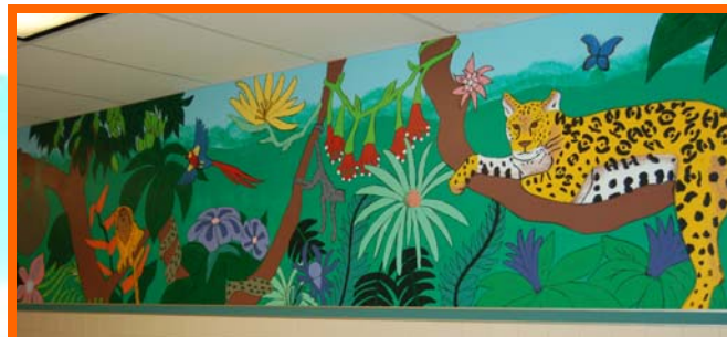
Hallway mural at East Pike Elementary School