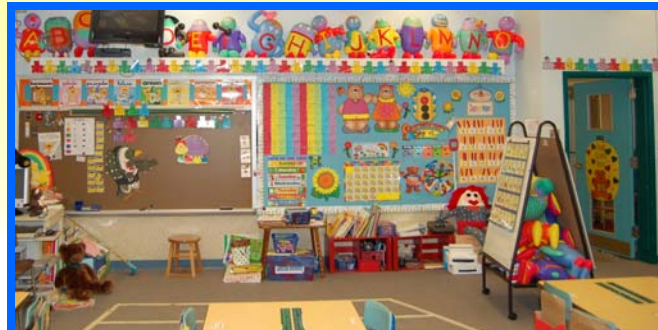
Color fills a kindergarten classroom at East Pike Elementary School