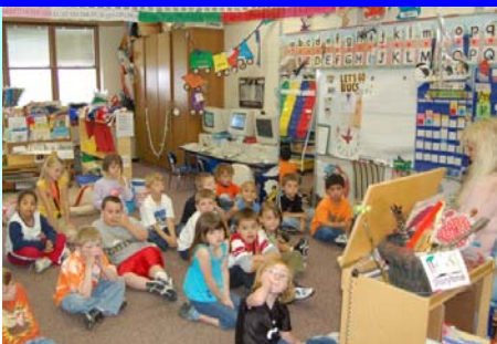
Reading activity in a kindergarten class at Blairsville Elementary School.