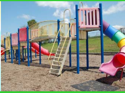
Blairsville Elementary School playground.