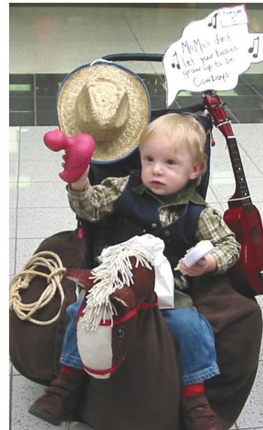
Decorated Stroller Contest Winner! (Funniest.) Mama's Don't Let your Babies Grow Up To Be Cowboys.

Contests included the Decorated Stroller Contest and the Parent Child Look-A-Like Contest . Pictures of contest winners and other Fun Fest Facts can