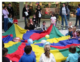
Children have a great time playing a parachute game