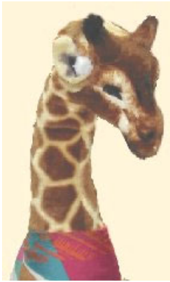
A 5 ft. tall plush Family Fun Fest Giraffe was one of the prizes given away at the event.